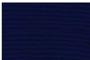
Dark Blue R173