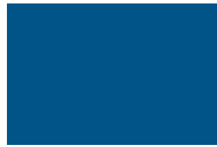
Blue Pantone 7692 C