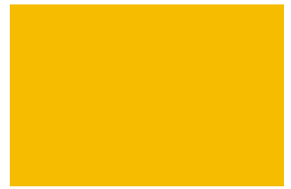
Yellow Pantone 7408 C