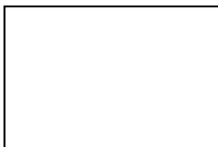
White Pantone White