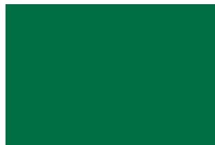
Green Pantone 7733 C