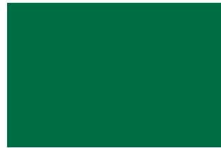
Green Pantone 7733 C