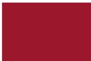
Red Pantone 7427 C