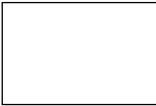
White Pantone White