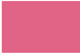
Pink Pantone 7423 C