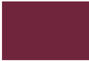
Maroon Pantone 209 C