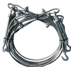
Steel Cross Wires (x2)