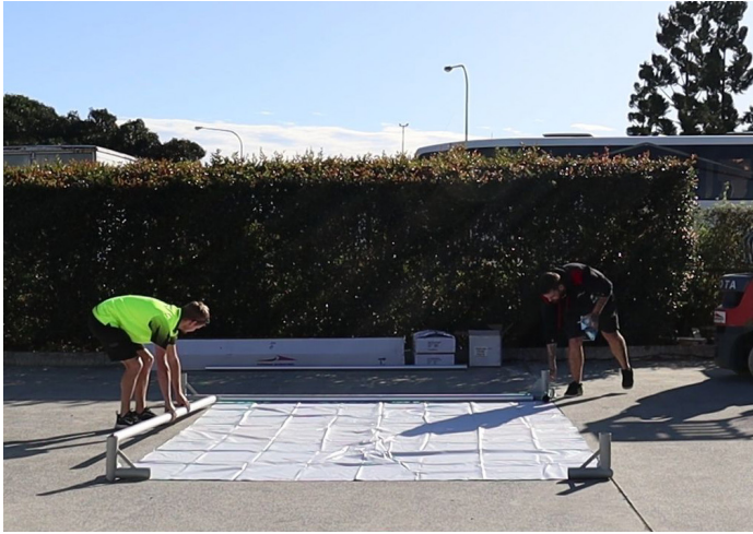
Layout all roof beams and connectors into position.

Please read instructions completely before setting up your marquee. Make sure you have all the components identified on the Parts List. Recommended procedure below. For safety reasons it is recommended that 2 persons set-up / pack down any marquee.