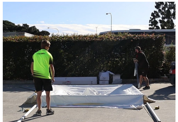
Layout the 4 aluminium legs.