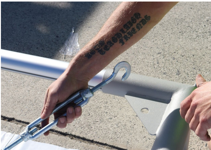
Attach both cross wires from corner to corner.