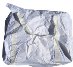
PVC Roof / Protective Cover (x1)