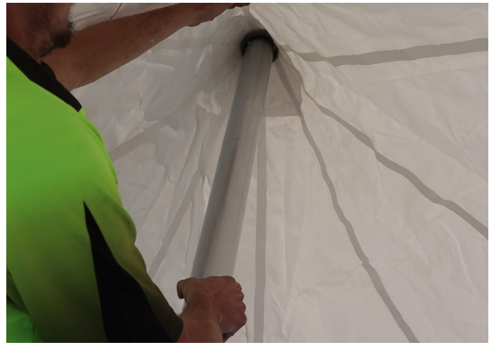
Position center pole in the peak of the roof