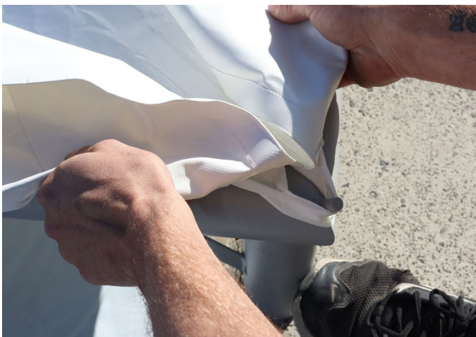
Attach all corners of the PVC roof to the corner connectors on the frame.