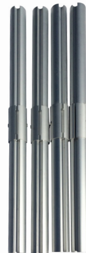
Aluminium Roof Joiner (x4)