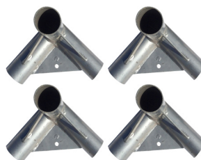
Steel Corner Connector (x4)