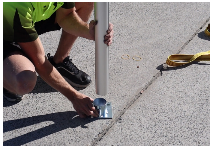
Attach steel foot to the bottom of Legs. Repeat on all sides.