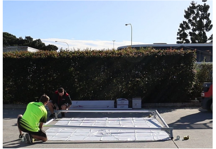
Once in place connect the 4 steel corner connectors to the 4 aluminium roof beams.