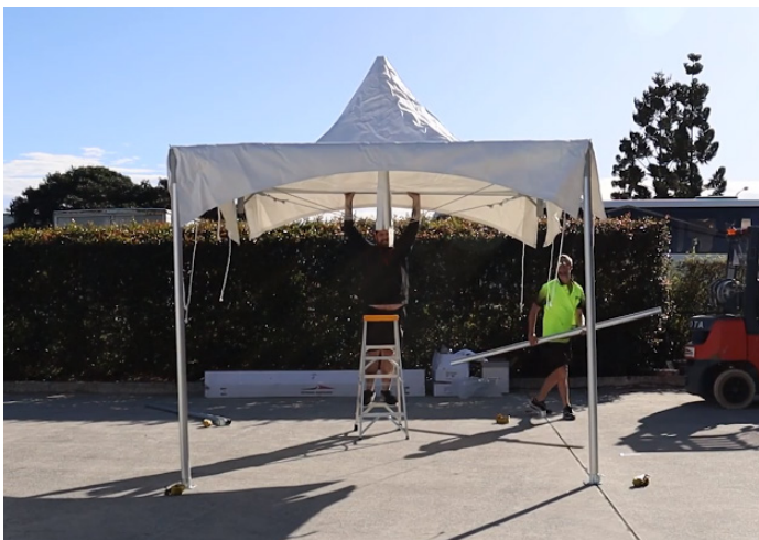
Insert the remaining legs into the corner connectors.