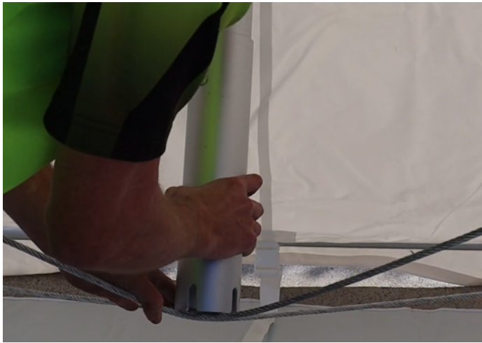
Slide the centre pole into cross wires and position.