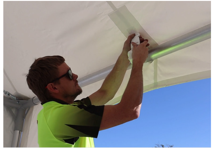
Attach roof straps around roof beams. Repeat on all sides.