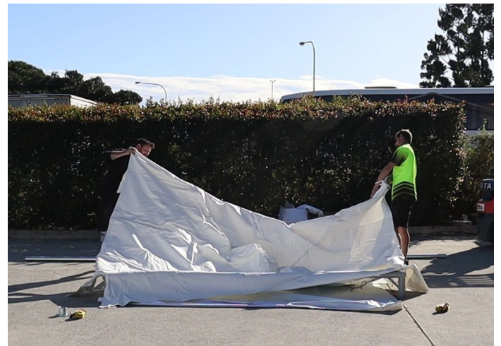
ATTACHING THE PVC ROOF Layout PVC roof over the frame.