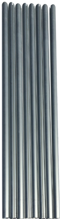
Aluminium Roof Beams (x8)