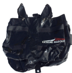
PVC Sandbags (x4) *