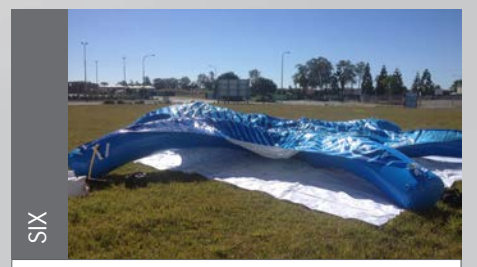
Turn pump on and proceed to inflate.