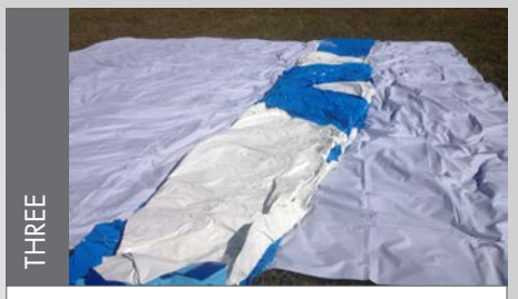
Roll out the marquee.