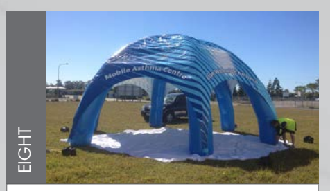
Ensure all legs are lined up and roof is centred. Check frame is firm (do not overinflate).