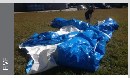
Fold legs on top of each other.