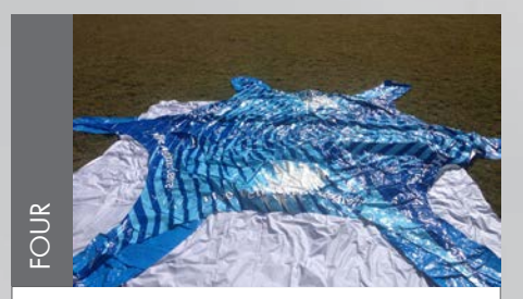
Roll out marquee flat ensuring the frame tubes are not tangled.