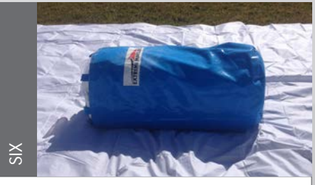
Proceed to roll marquee up. Pack marquee into protective cover. Roll up ground sheet and store pump.