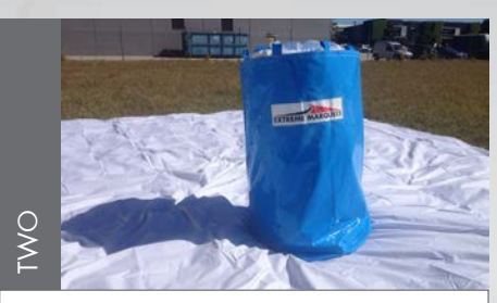
Remove marquee from protective cover