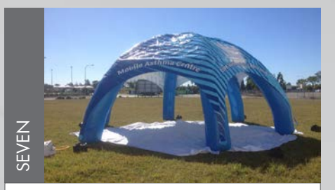
During the inflation process raise legs into the centre until all legs are upright.