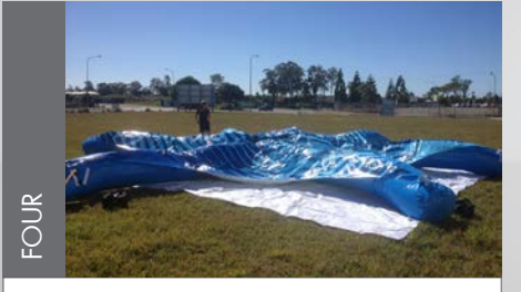
Continue to deflate and pull legs out to lay inflatable flat.