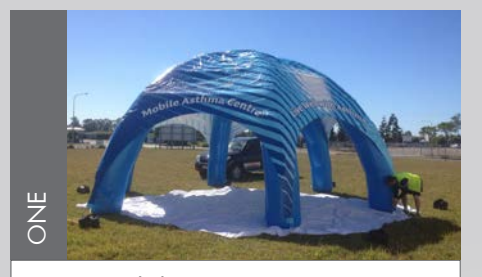
Lay ground sheet out into position to protect inflatable.

Recommended procedure below. For safety reasons it is recommended that 2 persons set up any marquee. Ensure area is free from any sharp objects & overhead objects.