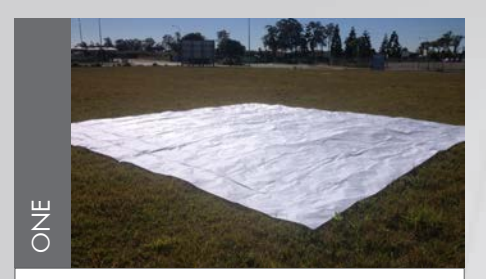
Layout ground sheet into position.

Recommended procedure below. For safety reasons it is recommended that 2 persons set up any marquee. Ensure area is free from any sharp objects & overhead objects.