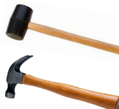
Hammer / Mallet