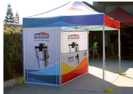
1.2m full perimeter walls (2) and 3m internal partition half wall.