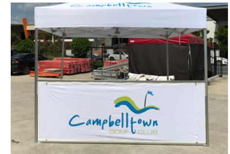
Custom marquee with custom 3m half wall.