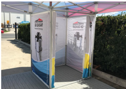
1.2m full perimeter walls (2) and 1.2m internal partition walls (2).