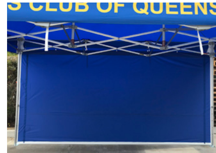
Custom marquee with a standard blue full wall.