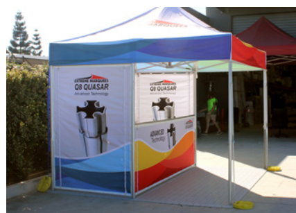
1.2m full perimeter walls (2) and 3m internal partition half wall.