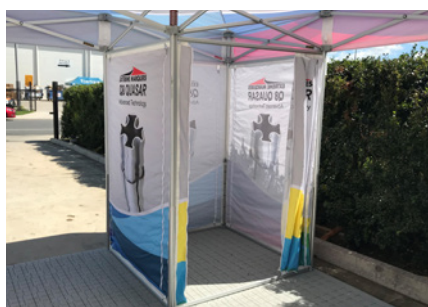
1.2m full perimeter walls (2) and 1.2m internal partition walls (2).