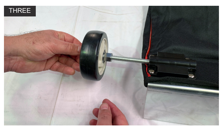
Insert the assembled wheel and bolt into the connector on the base of protective cover, thread the bolt until finger tight.