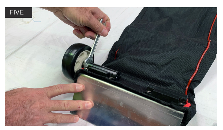
Tighten the nut on the inside of wheel until tight. ENSURE WHEEL SPINS FREELY.