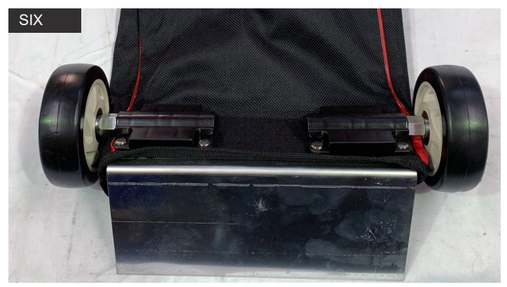
Repeat on other side. Completed X5 Wheeled Protective Cover.