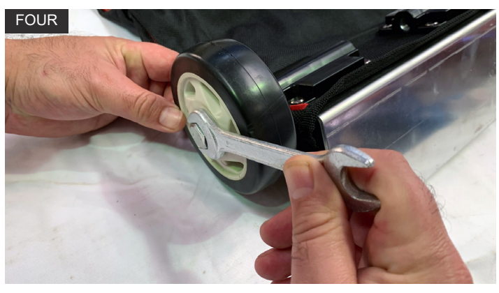
Spanner provided Tighten the bolt on the outside of wheel until tight.