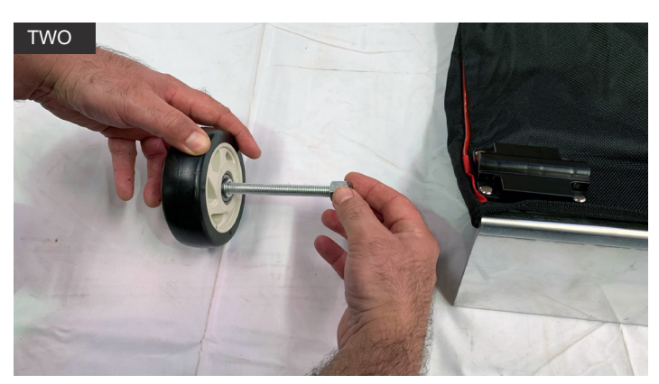
Insert the bolt through the wheel and bearing. Thread the nut until finger tight to secure the wheel.