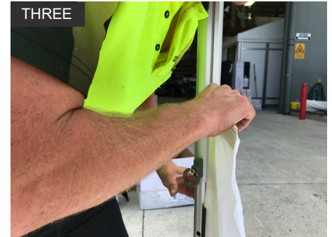
THREE Insert the top section of the of the Wall Strip Keda into the tracking of the Upper Leg of Marquee.