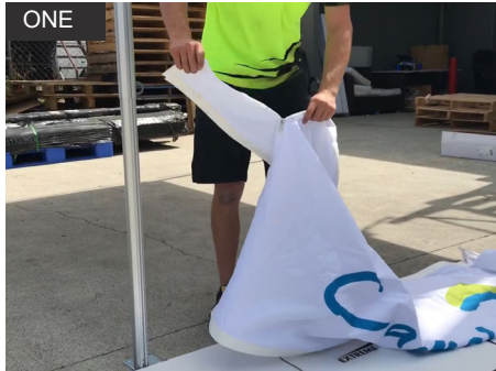
ONE Unzip the Left and Right Wall Strips on the Half Wall Panel.

Recommended procedure below. For safety reasons it is recommended that 2 persons set up any marquee. Ensure area is free from any sharp objects & overhead objects.