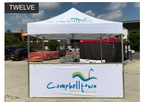
TWELVE Finished Product.