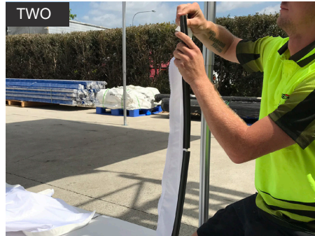
TWO Slide the Leg Rubber Inserts (2) along the Keda of the of the Wall Strips. Align to the bottom of Wall Strip.