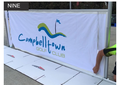
NINE Bottom of Half Wall. Insert the Half Wall Keda into the Support Bar and slide fabric along Bar.