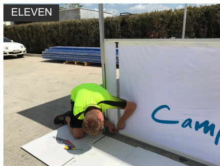
ELEVEN Zip the Wall Strip and the Half Wall Panel together.