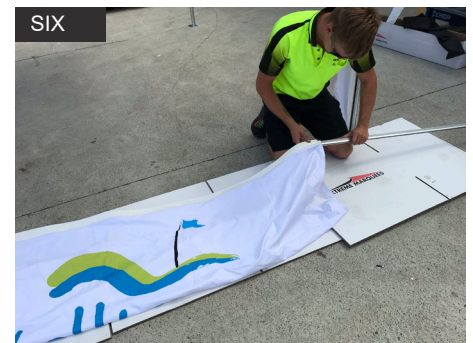
SIX Top of Half Wall. Insert the Half Wall Keda into the Half Wall Support Bar and slide fabric along Bar.