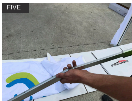
FIVE Assemble the Half Wall Support Bars for the top and bottom of the Half Wall.