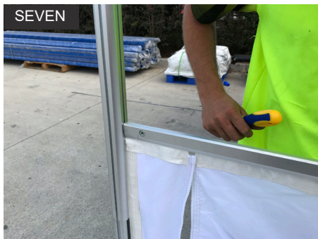
SEVEN Insert the Wall Strip Keda into the Half Wall Bar. Insert the Half Wall Support Bar into the Tracking of the Upper Leg of the Marquee.