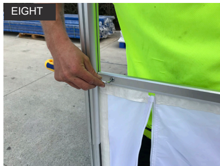
EIGHT Using the supplied tool, tighten the bolt lightly. Repeat on other side. Adjust the Half Wall Bar as need to be level and in desired position, tighten bolts to secure.