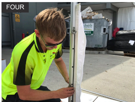
FOUR Press the Leg Rubber Inserts into the tracking on the Lower Leg of the Marquee. Repeat on other side.