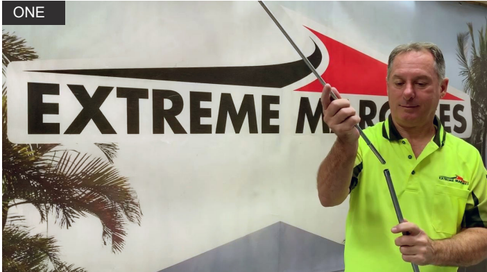
ONE Assemble the Banner Pole. Small - 2 peices / Medium - 3 peices / Large - 4 peices

Recommended procedure below. Ensure area is free from any sharp objects and overhead objects.