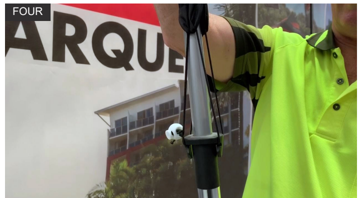
FOUR Attach the elastic from the Banner fabric to the Hooks on the Banner Pole.