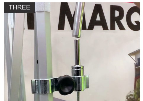
THREE ALL BANNER BASES Position the Banner Pole onto the Spindle.