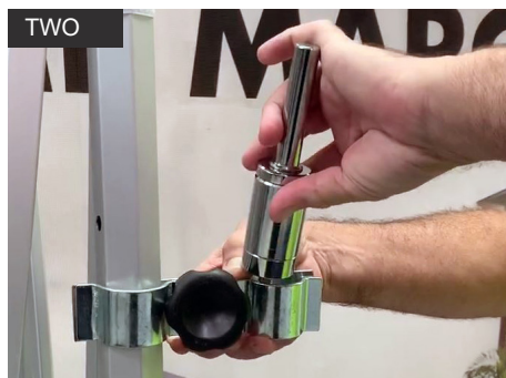
TWO MARQUEE LEG CONNECTOR Insert the Banner Spindle into the Connector, tighten the Connector until firmly fitted.