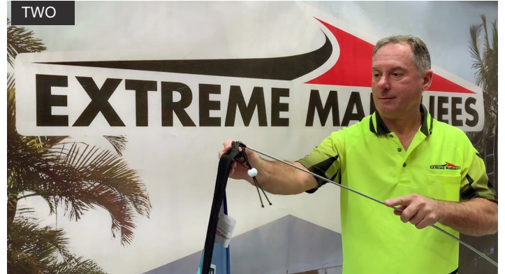
TWO Insert the Banner Pole into the sleeve of the Banner fabric.