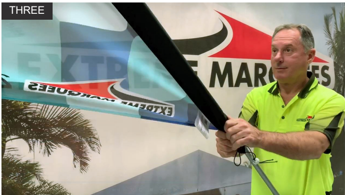
THREE Applying even pressure pull the Banner Fabric to the base of the Banner Pole.