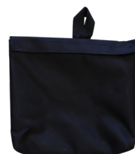
2x Parts Bag